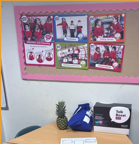
St Patrick's Catholic Primary School