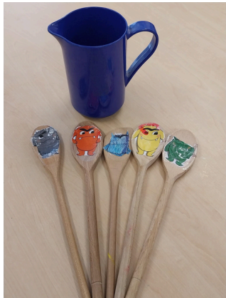
Meole Brace Primary School Nursery

The mental health and well-being agenda is at the forefront of everything we do and supporting children from a young age to both recognise their own emotions and communicate these to others, is a crucial part of any school curriculum. Many of our settings are using some wonderful resources to support children from the moment they join, with positive results.