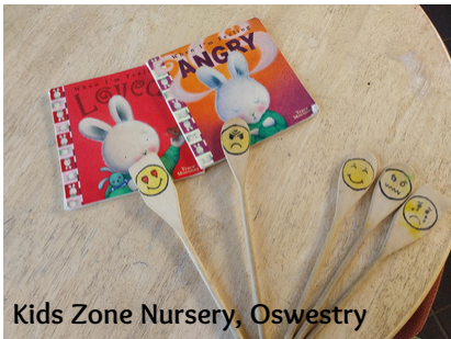
Kids Zone Nursery, Oswestry