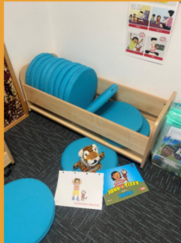
Redhill Primary School