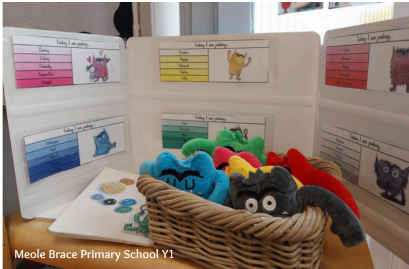
Meole Brace Primary School Y1